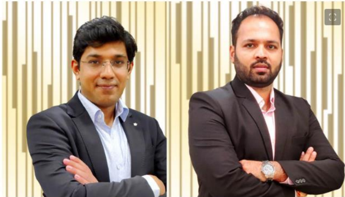
Future Generali India Life Insurance Company Ltd. looks at strengthening its market position and targeting more opportunities to grow strongly in the life insurance space, the company stated.